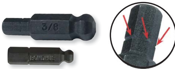
Ideal for 1/4" / 6mm retaining ring tools