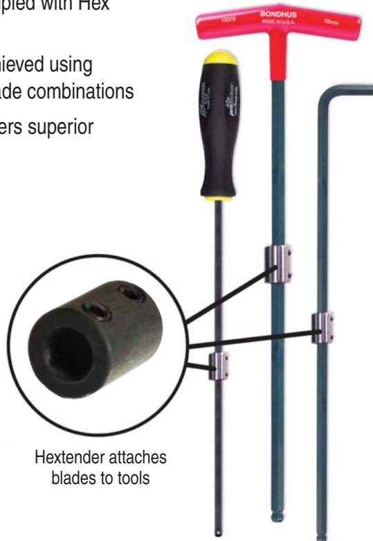
Hextender attaches blades to tools