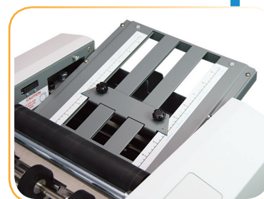
Redesigned fold plates - Clearly marked and easier to adjust