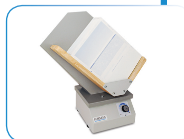
402 Series Jogger - an option which reduces static electricity from forms and aligns them for proper feeding