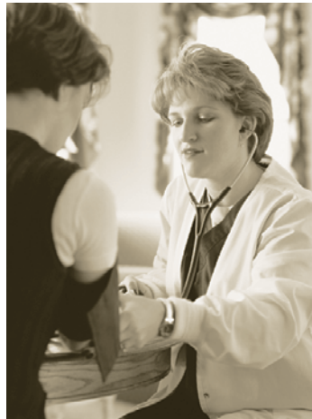
Blood Pressure Measurements