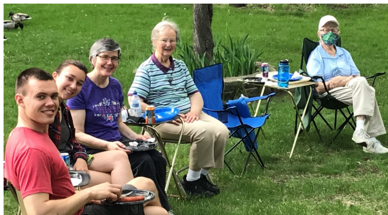
Memorial Day social distancing party at Pat's house