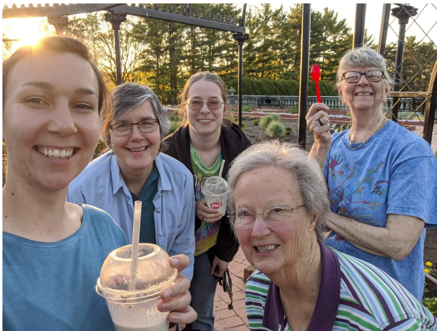
Spring trip to the Dairy Queen!

These gifts of peace, joy and belonging will stay with me far into the future. Although FCV is ending in the sense that I will leave and there will be no new volunteers, FCV lives on in the spirits of those who came, lived it and carry it with them now to each moment of their lives.