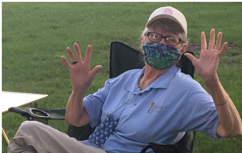
Our new normal?