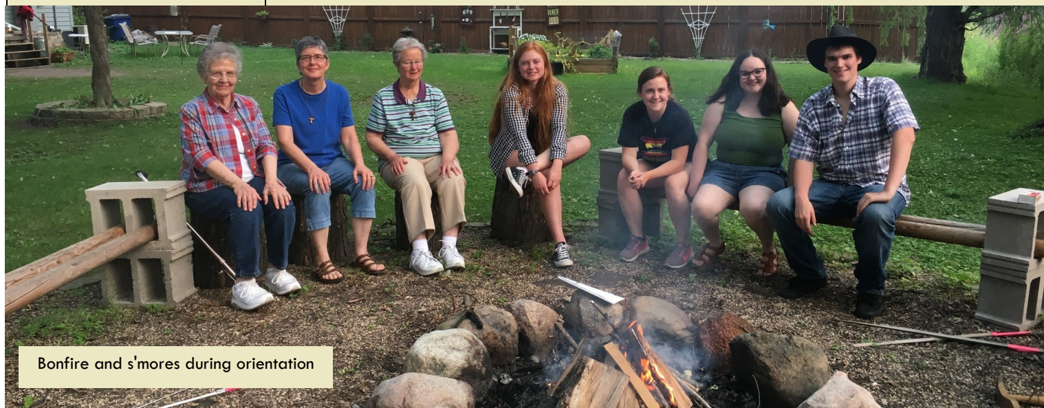
Bonfire and s'mores during orientation