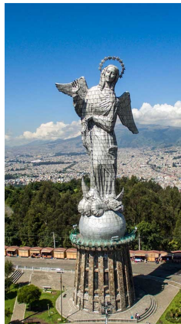
El Panecillo Virgin

We give thanks to those who made it possible for us to meet and strengthen the relationship of our brother/sisterhood and joint mission. ☺