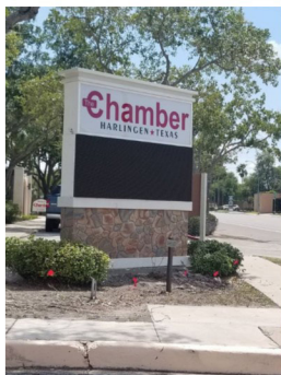
Billboard located on the corner of E. Tyler Avenue & 3rd street-Harlingen