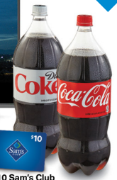
$10 Sam's Club Gift Card