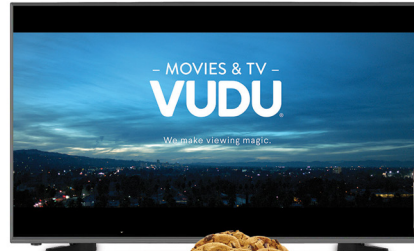
$25 Vudu Movie Credit

Join as a $45 Sam's Club member and get a free meal, $25 Vudu movie credit and a $10 Sam's Club gift card.