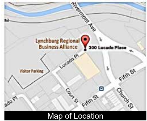
Map of Location

Lynchburg Regional Business Alliance Headquarters 300 Lucado Place, Lynchburg VA