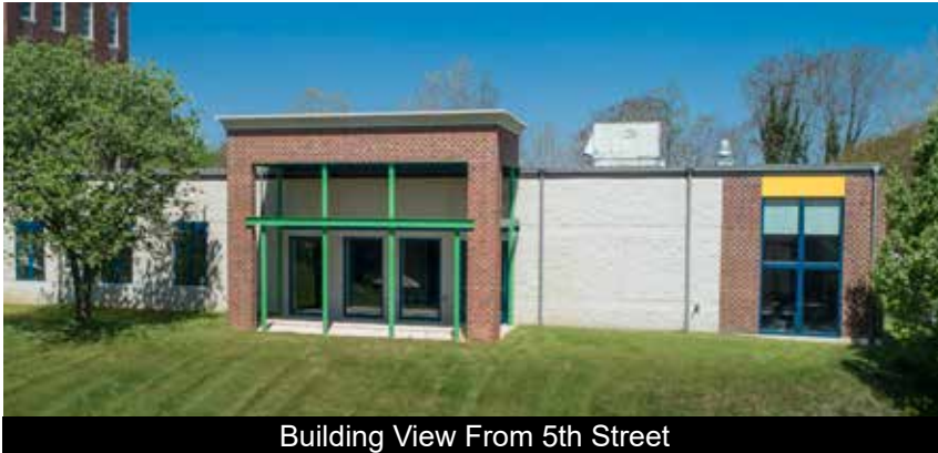
Building View From 5th Street