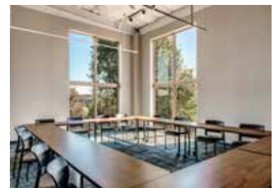
Small Conference Room

Contact: Gary W. Case & Co., Inc. Office: (434) 847-6692 Email: gary@garycaseco.com