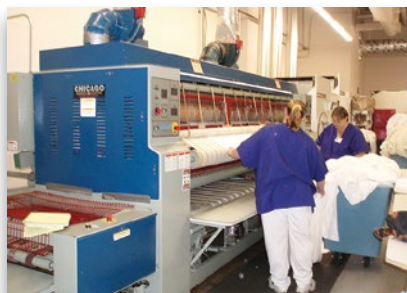
Left: Feeding an Air Chicago XL (left) and Tristar (right).