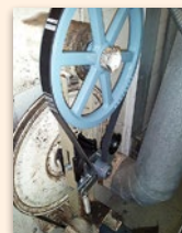
After: New Huebsch All belt drive.