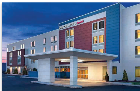
Spring Hills Suites By Marriott