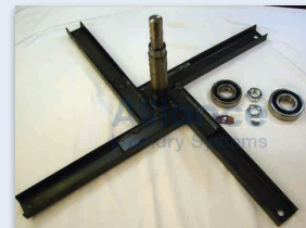
Huebsch Tumble Dryer trunnion & bearings

You don't need Paul Bunyan to fix your trunnion. Even though he has the strength of ten men, in just a short time our technicians can. If you can lift up your dryer drum more than an inch, stop running the dryer now, before you're in a pinch. The clunking and clanking noises are key. Act now to avoid this tragedy. With New Years Eve's clock ticking fast, "tick tock". We have the bearings, flange and pillow block. Purchase parts before your dryers are on the fritz. We stock all the latest trunnion and bearing kits. I'll package the trunnion and put it in a big box. If the snow gets too deep, I'll call Babe the blue ox. Good tidings I wish you with holiday cheer. Merry Christmas all and a joyful New Year.