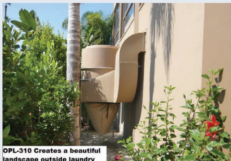
OPL-310 Creates a beautiful landscape outside laundry

For further information call your Minnesota Chemical equipment salesman and he will be able to tell you which unit would work best in your laundry.