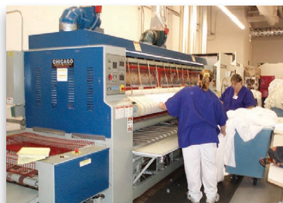
Left: Feeding an Air Chicago XL (left) and Tristar (right).