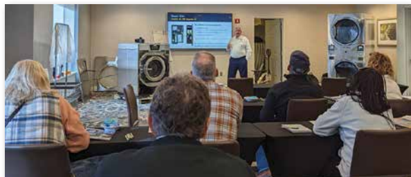
Minnesota Chemical Arden Hills, MN Seminar