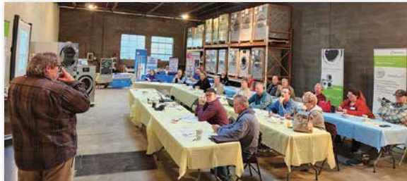
Menomonee Falls, WI Seminar