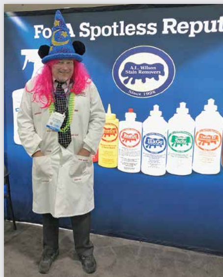
The Stain Wizard