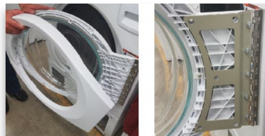
Door bezel kit before and after