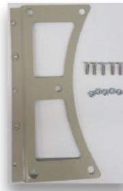
Door bezel kit

For more information, or to order a kit today, please contact me in the Minnesota Chemical Parts Department at (651) 288-4849.