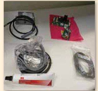
Clockwise from left: Ignition module-high voltage lead; OPL Control board-display board; door glass gasket-nylon washers; door bumper and glue