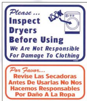
#L809 (Blue & Red Print • 13.5 x 16")