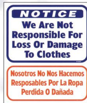
#L803 (Blue & Red Print • 13.5 x 16")