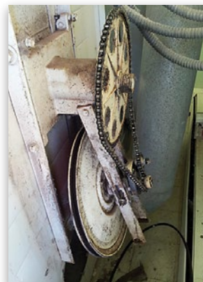
BEFORE: Old Huebsch Chain/Belt drive.