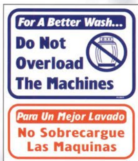
#L805 (Blue & Red Print • 13.5 x 16")