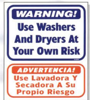
#L804 (Blue & Red Print • 13.5 x 16")