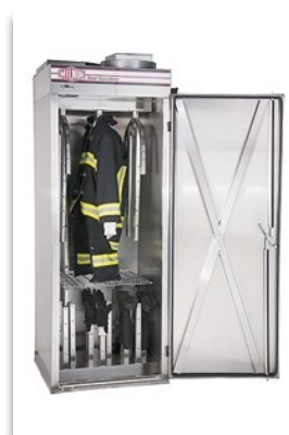
MILNOR Gear Guardian Drying Cabinet

CLEAN 2017 WHERE THE INDUSTRY COMES TOGETHER