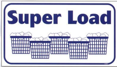
#L745 (Blue Print • 12" x 34")

Economical, Professional Signage Without The High Cost. Made From Durable High Impact Plastic - Will Not Dent or Rust. Screen Printed Blue Letters & Graphics - Will Not Chip Or Peel. Attractive & Informative Signs Make Your Job Easier!