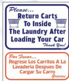
#L811 (Blue & Red Print • 13.5 x 16")