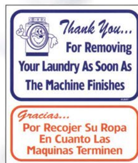
#L807 (Blue & Red Print • 13.5 x 16")