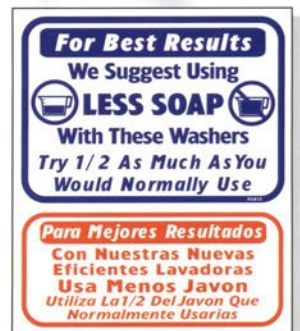
#L812 (Blue & Red Print • 13.5 x 16")