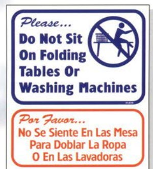
#L808 (Blue & Red Print • 13.5 x 16")