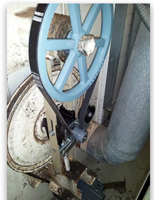
AFTER: New Huebsch All belt drive.