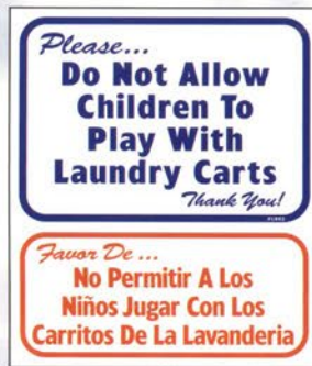
#L802 (Blue & Red Print • 13.5 x 16")