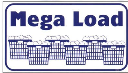
#L746 (Blue Print • 12" x 34")