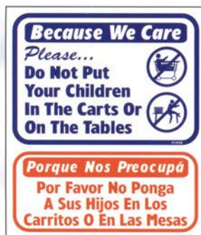
#L806 (Blue & Red Print • 13.5 x 16")