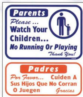
#L810 (Blue & Red Print • 13.5 x 16")