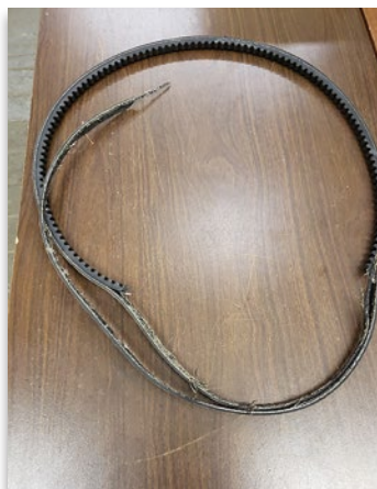
Broken and frayed belt

Missing a manual – call Barb in parts with your model and serial number to order a new manual. 800-328-5689.