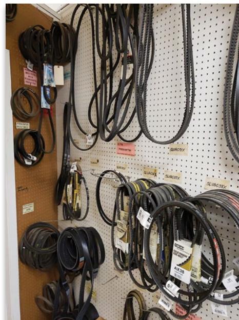
Part of our belt stock