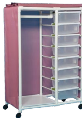
MODEL VL DBC16 ..... $460 65" H x 44.5" W X 24" D 16 bins, 22" hanging bar, cover opens on both sides