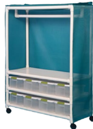
MODEL VL DBC8 ..... $380 65" H x 50" W X 20" D 8 bins, 44" hanging bar

Open shelf linen carts also available in this "Value Line".