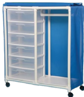
MODEL VL GR 66..... $325 56" H x 50" W X 20" D 6 drawers, 20" hanging bar