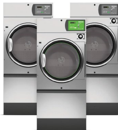
Vended 25-, 30-, 35- and 55-lb Tumble Dryers

Call me – I will be glad to help or send a tech.