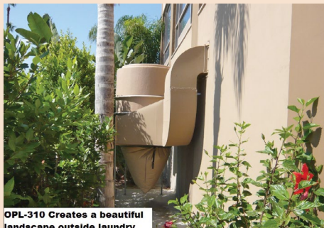
OPL-310 Creates a beautiful landscape outside laundry

For further information call your Minnesota Chemical equipment salesman and he will be able to tell you which unit would work best in your laundry.