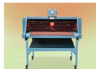
Smartly productive and safe MAT ROLLERS

All CLM equipment can seamlessly integrate into any laundry facility.