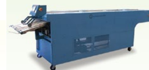
Clever and fast TOWEL FOLDERS