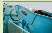
Intelligently efficient SHUTTLE CONVEYORS