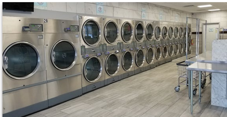
New Laundry with great lighting, clean bright walls and floors with new stainless steel front dryers

4. Failure to Upgrade Store: Hardmount washers and dryers usually last about 15 years before they need to be replaced. Small chassis machines might need replacement after 10 years. Customers like alternative payment systems such as credit cards, mobile pay with smart phones or loyalty cards with kiosks.