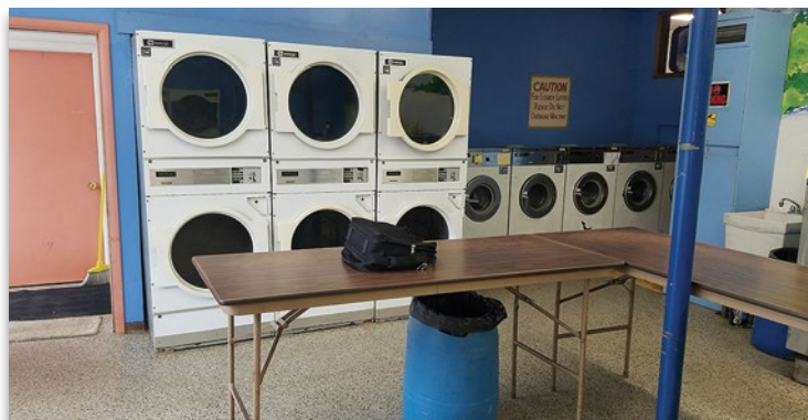
Old Laundry with very old washers and dryers, poor lighting, dirty floors