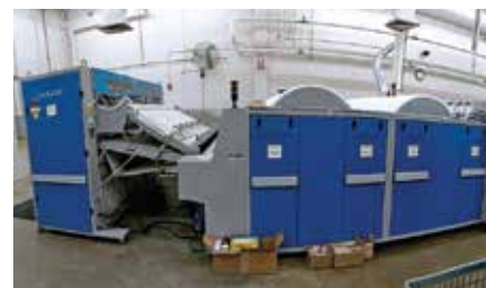
Chicago Century Ironer before canopies were installed