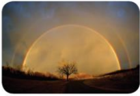
"And we pray this in order that you may live a life worthy of the Lord and may please him in every way: bearing fruit in every good work, growing in the knowledge of God." Colossians 3:10