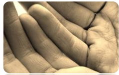
Fulfilling God's Purpose!