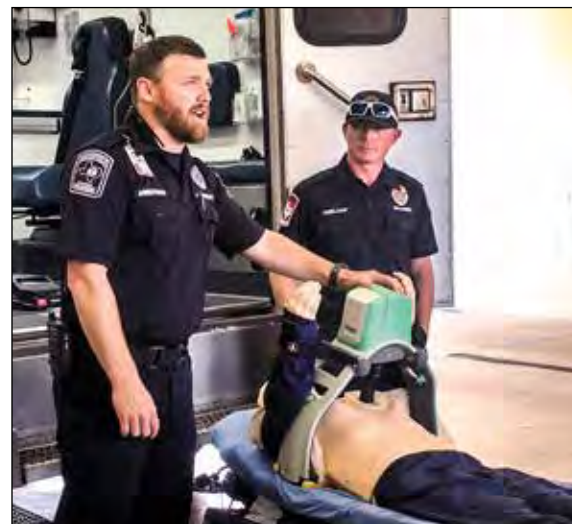
LUCAS CPR Demonstration by Washington County EMS Paramedics.