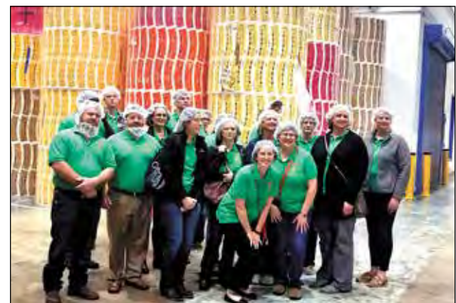
The group really enjoyed the tour of Stanpac.