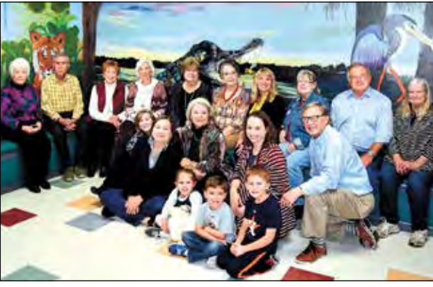
Unveiling of the New Pediatric Mural