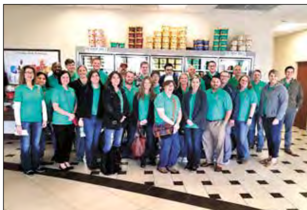
The group in the Blue Bell parlor.