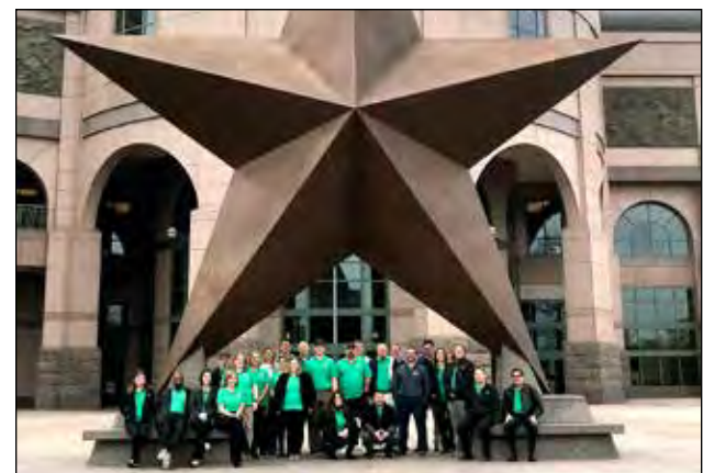
Outside the Texas State History Museum.