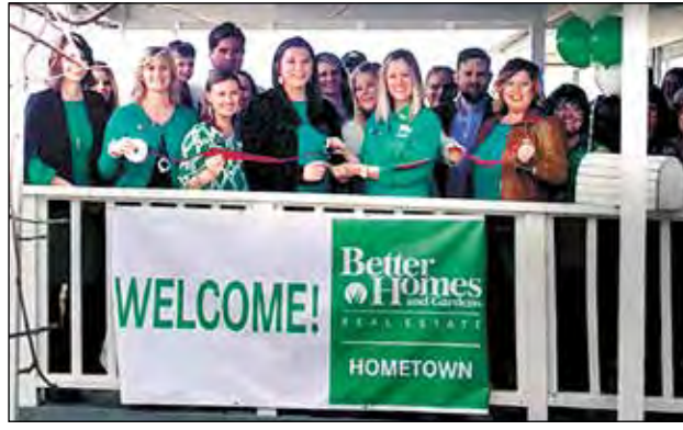
Change of Business Name