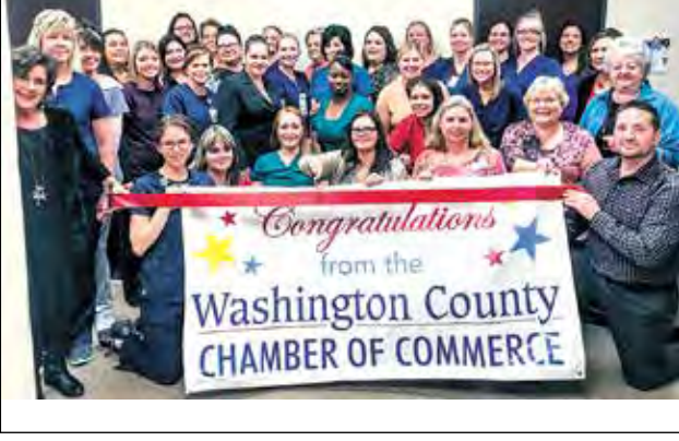
Change of Business Name