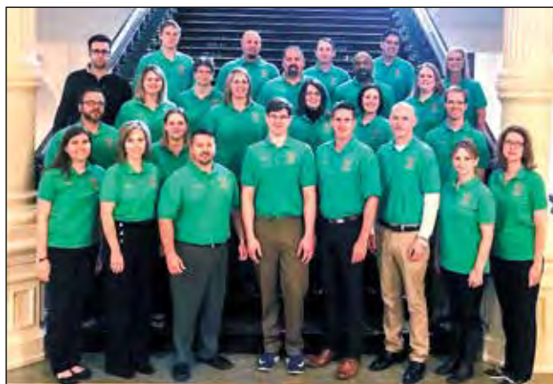
LWC Class of 2018