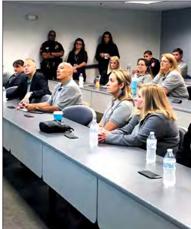
Class participants are all ears as local law enforcement officials address them.