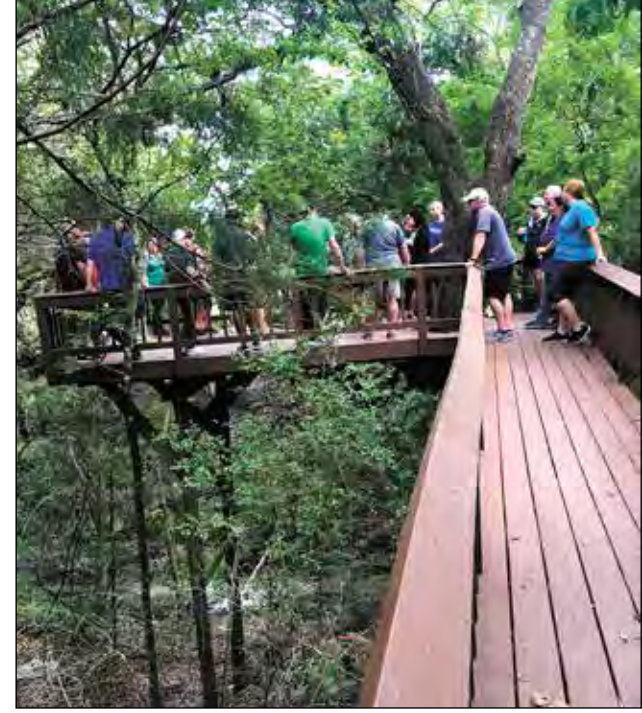
Camp For All is on 206 acres outside of Burton and features more than 100,000 sq. ft. of facilities, two lakes, nature trails, wooded areas and cleared areas for a wide range of activities.