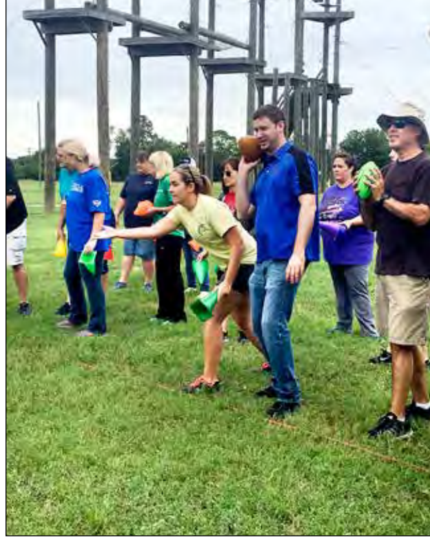
It was a group effort trying to toss items into a basket for points.