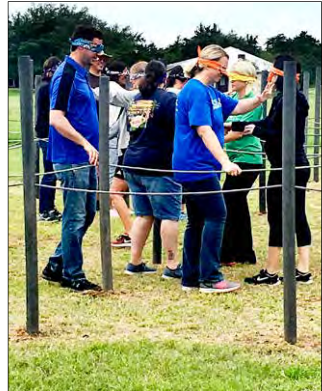
The class tries to find their way out of a roped maze while blindfolded.